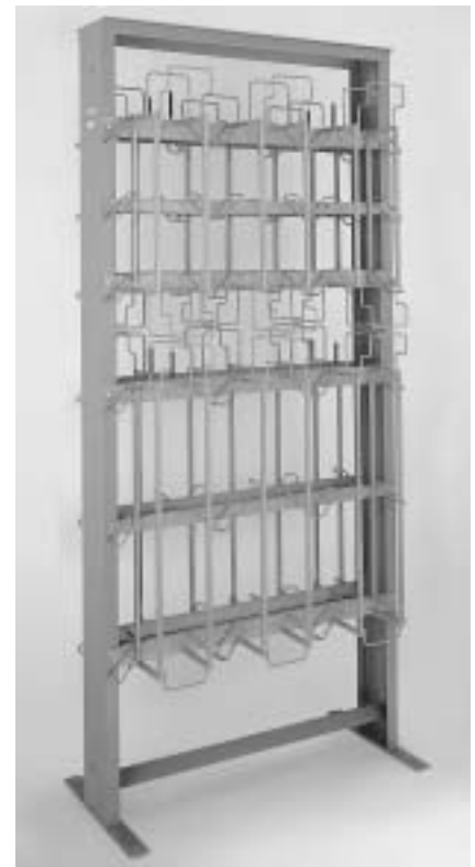
The 110D-9000 Frame is a double-sided frame used primarily in higher density installations requiring high pair counts with limited space for multiple frames.