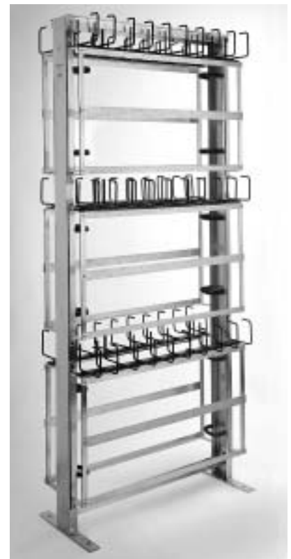
The double-sided 50M-5400XN Frame accommodates 18 blocks*. Other block types also can be mounted.