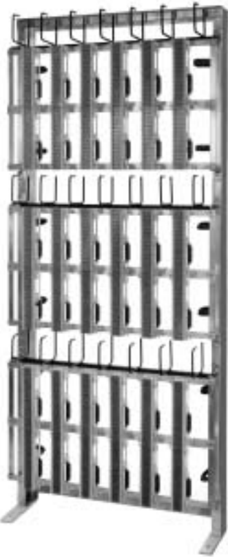
Designed for use with side-mounted connectorized blocks, the single-sided 50M-1800LH Frame has plenty of space for cable delivery. (Shown with connectorized blocks factory installed.)